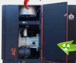
Absorbed electric energy = 100

Mattei offers for its compressors a heat recovery system that allows water to be heated for industrial process or sanitary use.