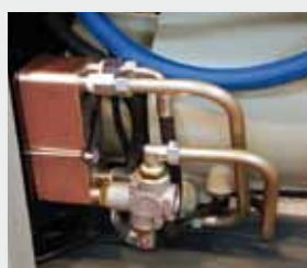
Recovered thermal energy \geq 80